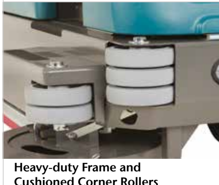
Heavy-duty Frame and Cushioned Corner Rollers

Overhead guard protects operators from falling objects.