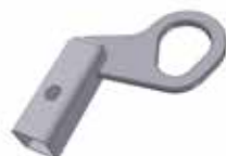
SHORT LIFTING EYE Optional