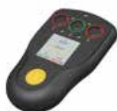
RADIO REMOTE CONTROL Optional