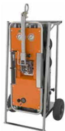
EASY TO TRANSPORT Optional